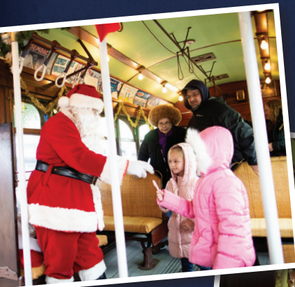
Holiday Rides with Santa!